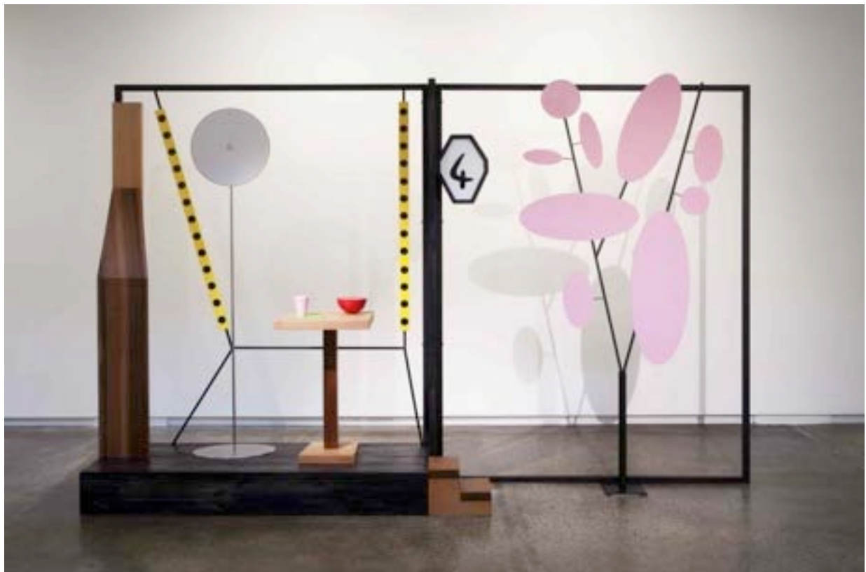
Image: Peter D Cole, Bar 4 – Shibuyu 2009, Painted wood, plastic, copper, steel, brass and aluminium, 210 x 323 x 50cm

Cole's distinct skill of distilling the landscape and architecture into separate elements and symbols is in itself evocative of traditional minimal Japanese aesthetic and he has created a series of works which draw upon Japanese interiors and street scapes and the gardens of the Sakura Matsuri (Cherry Blossom festival).